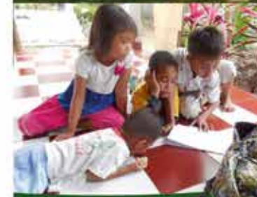
Impressions Anak DOMBA Bali